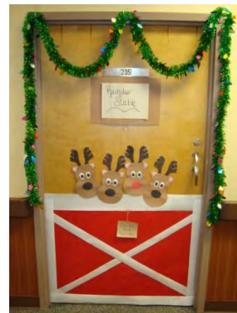
●Our creative staff members got very creative decorating resident doors this year!