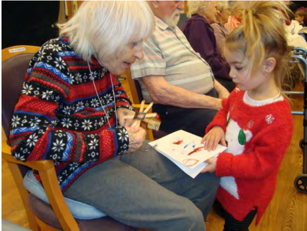
●Residents receive cards following a Holiday Program presented by the ABC preschool.